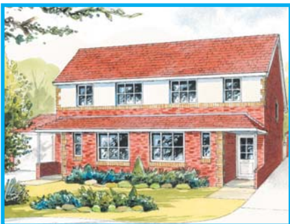
The Neath Semi-detached Plots 6, 7, 8, 9, 10, 11, 23, 24.