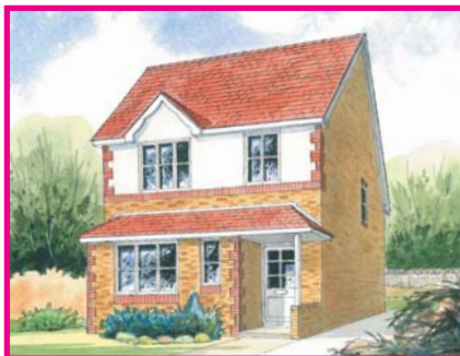
The Kinsale Plots 1, 2, 12, 13.