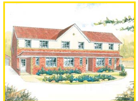
The Neath Terrace Plots 3, 4, 5, 14, 15, 16, 17, 18, 19, 20, 21, 22.

84a Bowen Court St Asaph Business Park St Asaph Denbighshire LL17 OJE